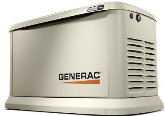
Product shown with optional fascia kit