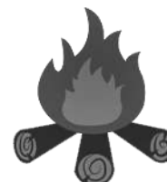
Wrapped Fire Logs