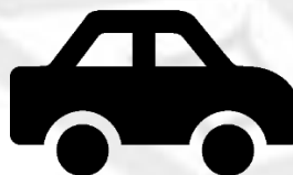
Car Safety Kit