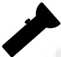
Flashlights & Batteries