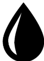
Case of Water