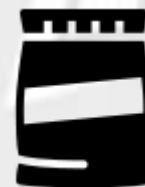
Sand, Salt, or Kitty Litter