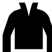
Additional Warm Clothing