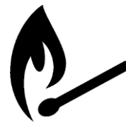
Water Proof Matches